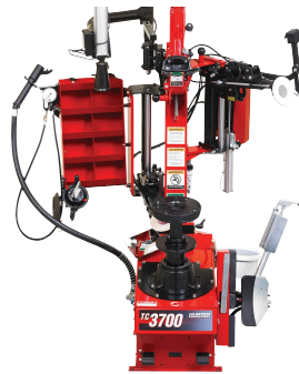
Shown with optional Side Shovel