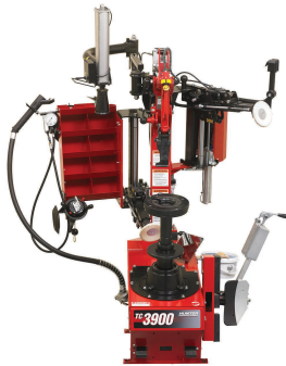
Shown with optional Side Shovel