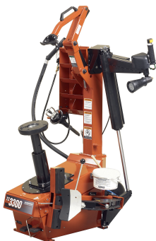
Shown with optional Plus Roller