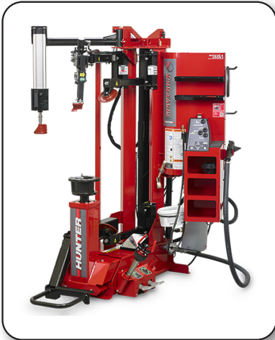
Maverick w/ Optional Wheel Lift