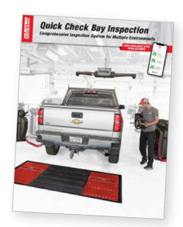
Check out other Hunter literature for more detailed product information.